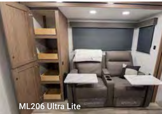
ML206 Ultra Lite