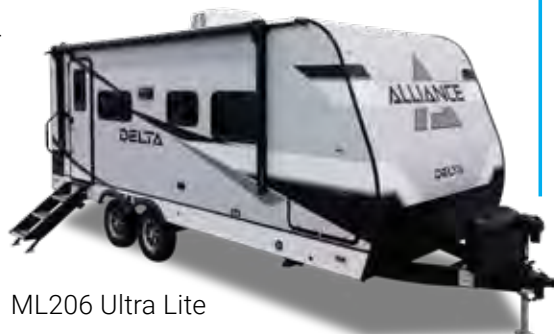
ML206 Ultra Lite